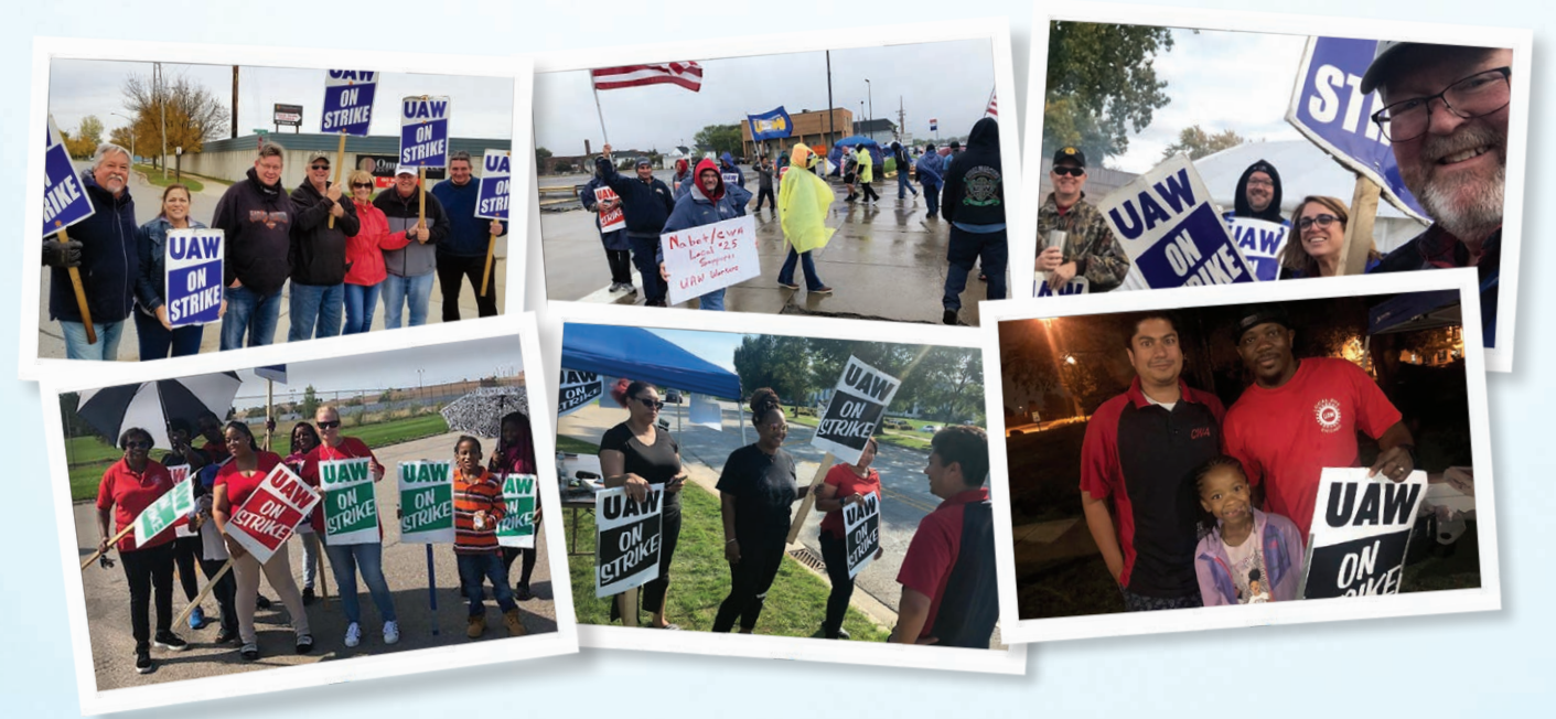
NABET-CWA members standing in solidarity with striking UAW workers.

central issues in the dispute is GM's insistence on using temporary workers, who often remain in that status for years without any path towards earning permanent status with the company. The Union would like to see this change. Additional items the union would like to see improve include fair wages, affordable healthcare, profitsharing, and increased job security.